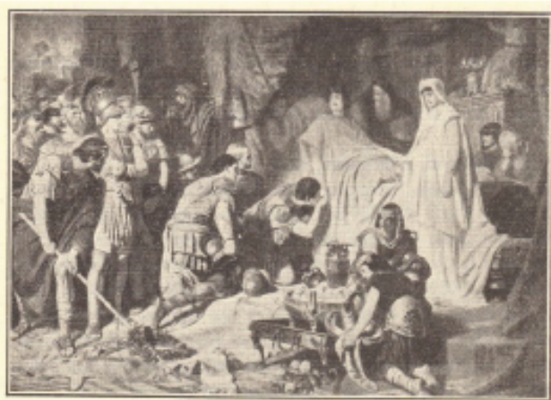
DEATH OF ALEXANDER THE GREAT

Egypt went to Ptolemy, whose descendants, including the famous Cleopatra, would rule the country until it was conquered by the Romans. Most of Alexander's Asian empire went to Seleucus. Macedonia and Greece went to Antigonus.