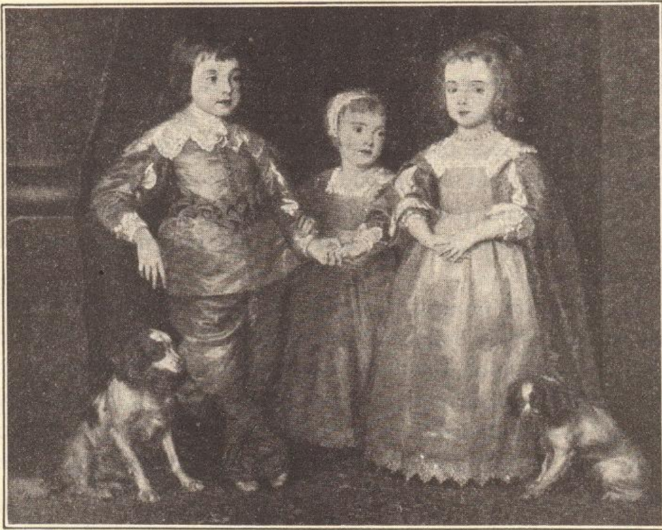
CHILDREN OF CHARLES I

William III and Mary II were not only husband and wife, but first cousins. William III was the son of Mary, sister of Charles II and James II.